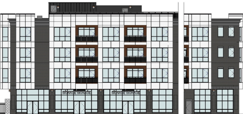
Partial Medford St. Elevation